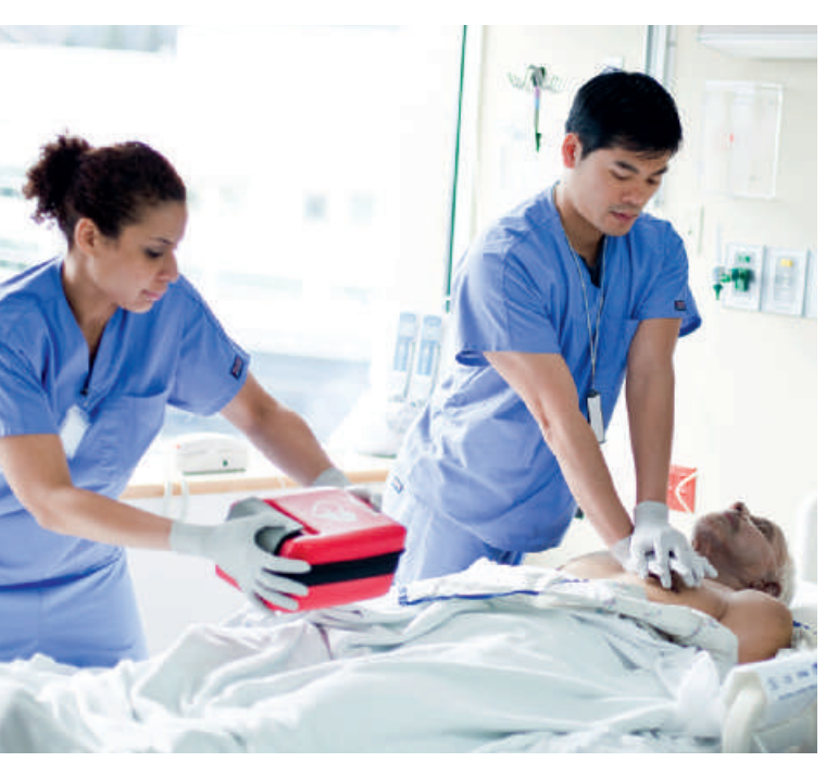
The HeartStart FR3 is small and light, which makes it easy to carry and maneuver in tight places.